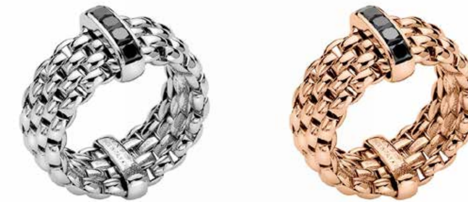
AN525 BBRN | CT. 0,7 Flexible ring entirely made of 18 carat gold with princess-cut black diamond feature.