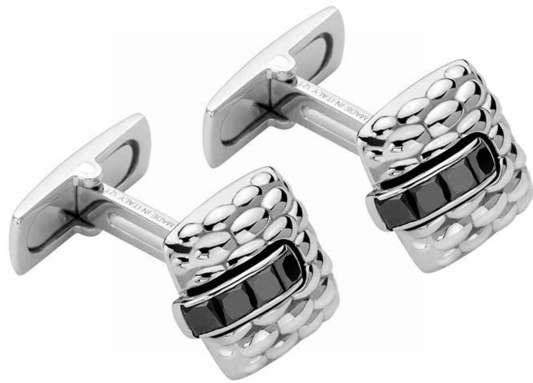
G07 BBRN | CT. 1,12 18 carat gold cufflinks with princess-cut black diamonds.