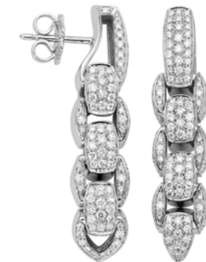
OR773 PAVE CT. 2,08 | Length 3,5 cm 18 carat gold earrings with diamond pavé.