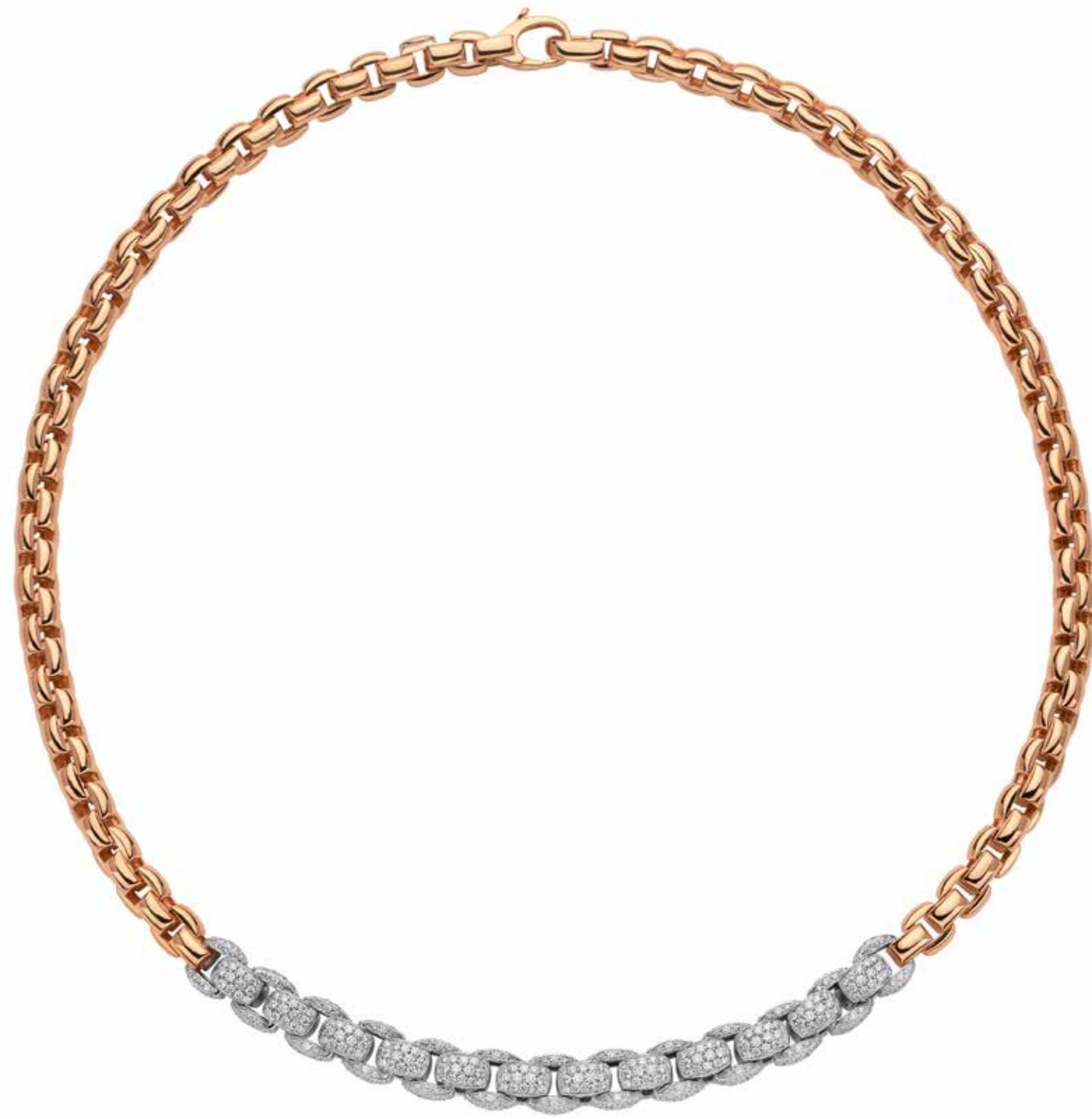
773C PAVE | CT. 4,91 18 carat gold necklace with diamond pavé. (43 cm)