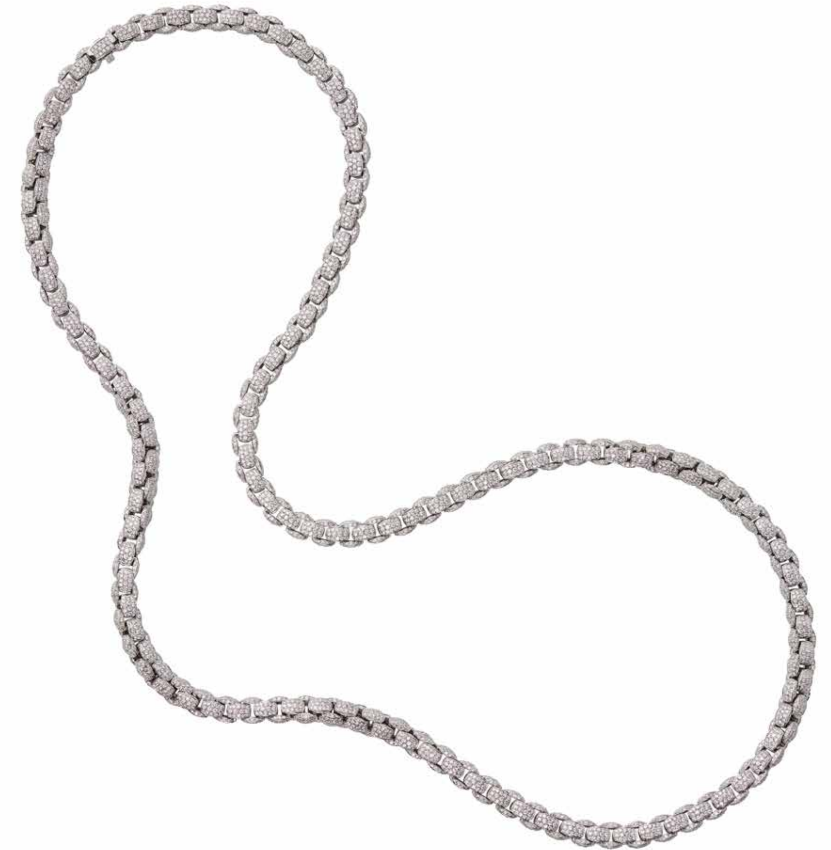
774C PAVE 85 | CT. 42,86 18 carat gold necklace entirely set with diamonds. (85 cm)