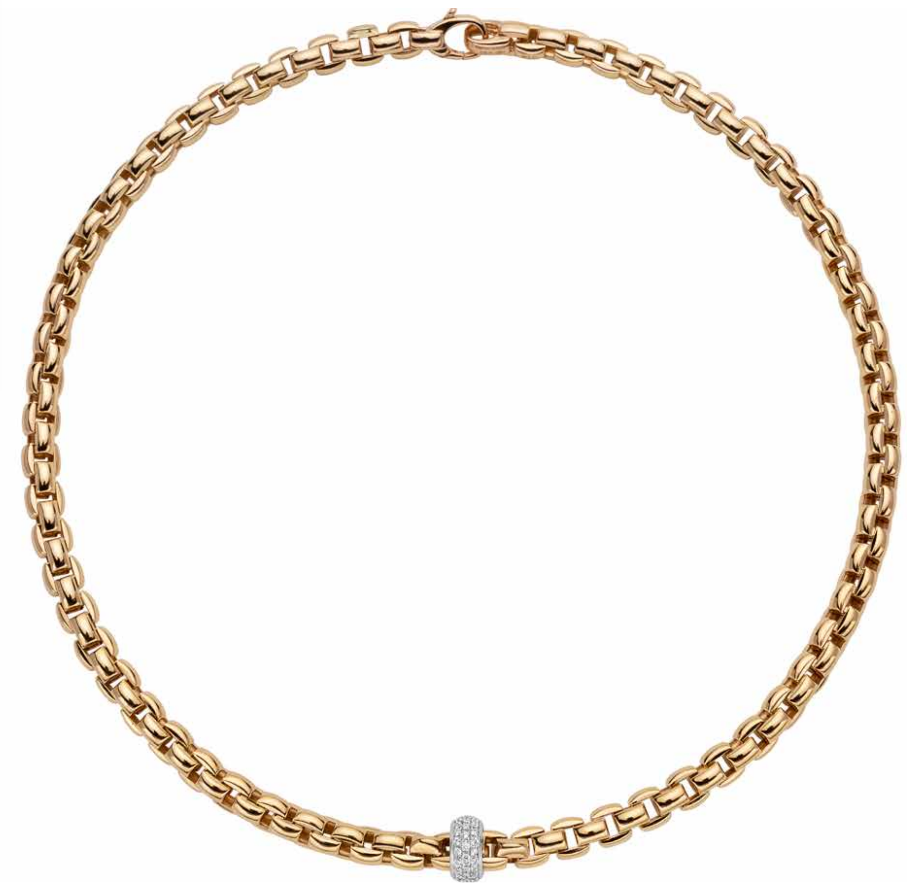
707C PAVE | CT. 0,4 18 carat gold necklace with diamond pavé rondel.