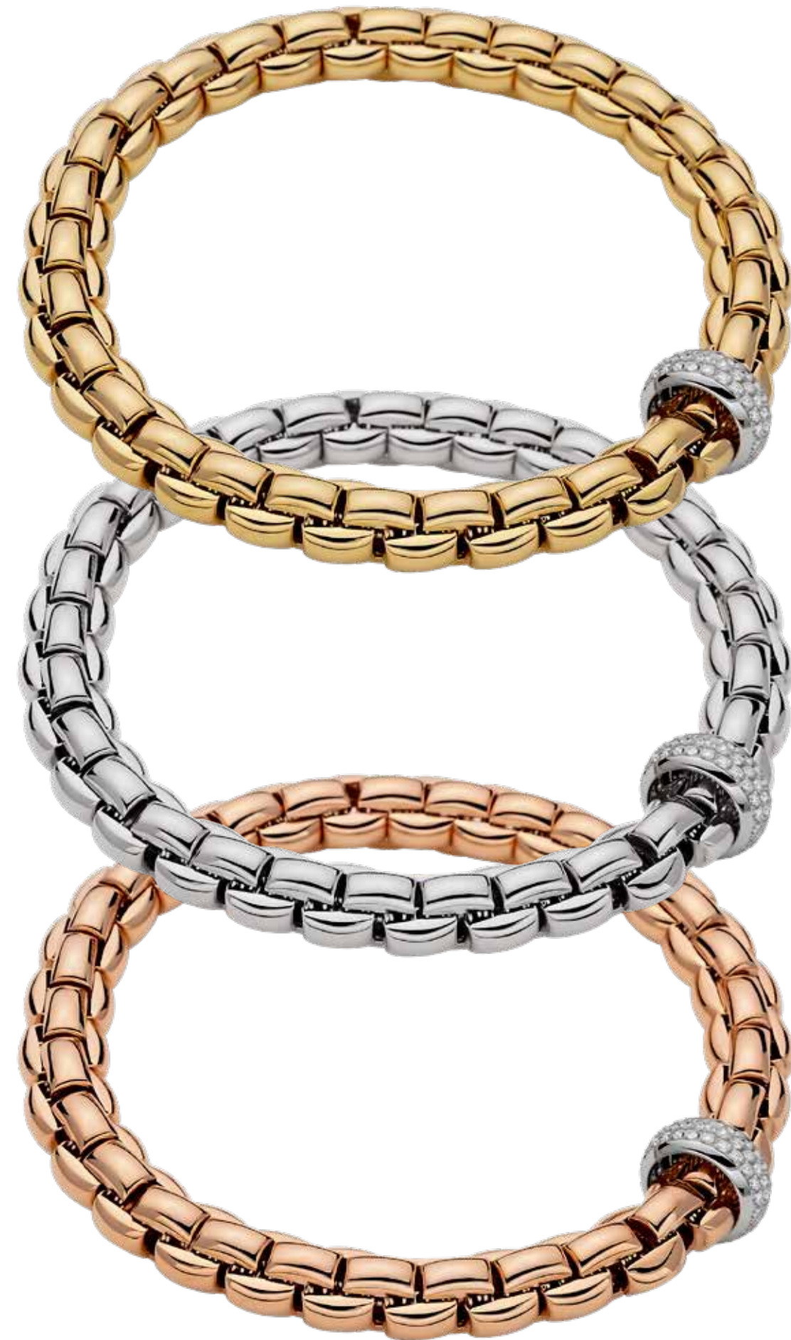
607B PAVE | CT. 0,58 Flexible bracelet entirely made of 18 carat gold with diamond pavé rondel.