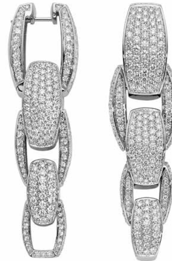
OR775 PAVE | CT. 2,7 | Length 2 cm 18 carat gold earrings with diamond pavé.