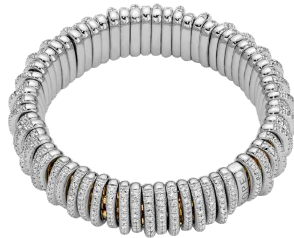
589B PAVE | CT. 4,94 Flexible bracelet entirely made of 18 carat gold with gold and diamond rondels.