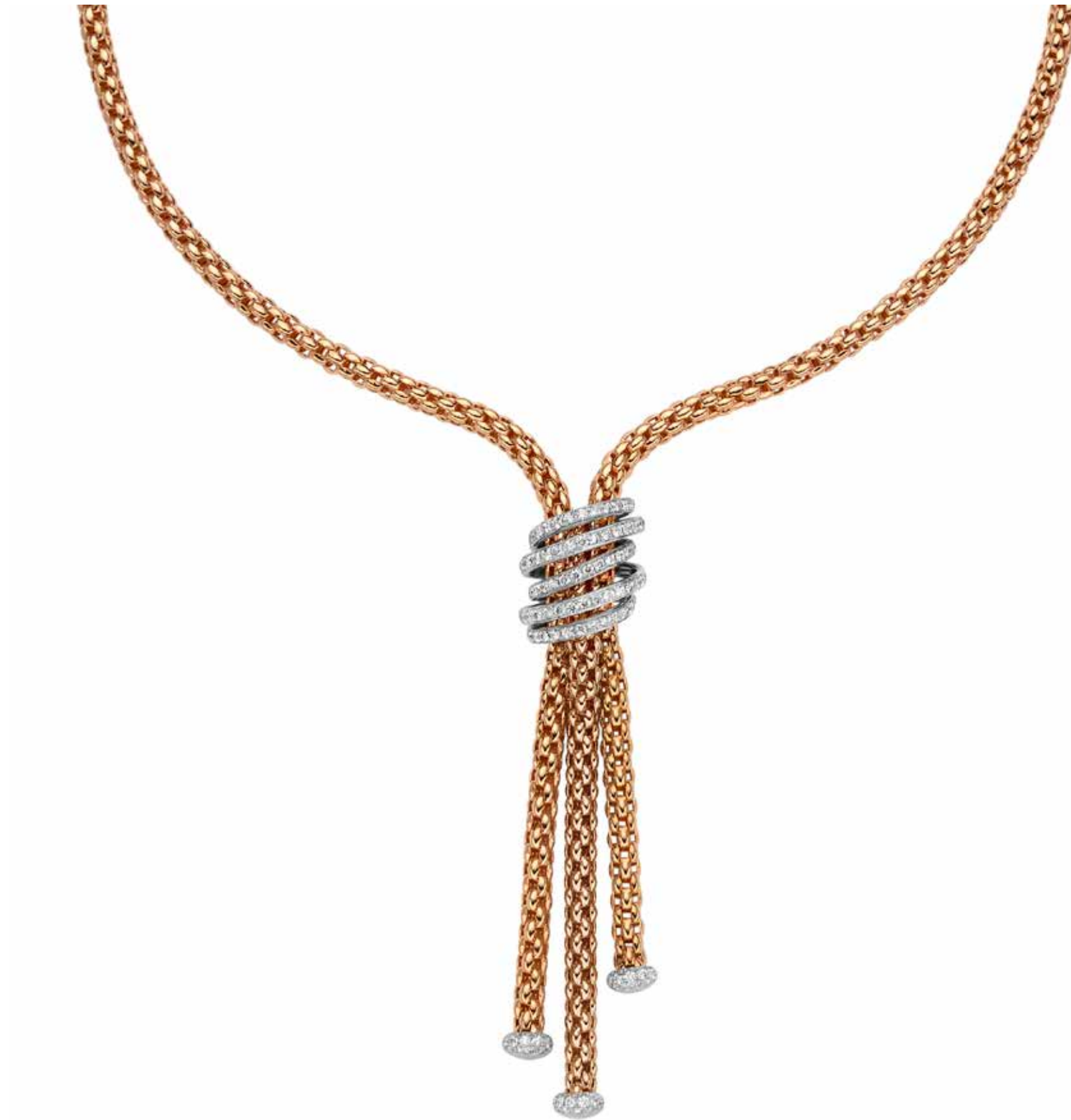
651C PAVE | CT. 1,63 18 carat gold lariat with diamond pave'.