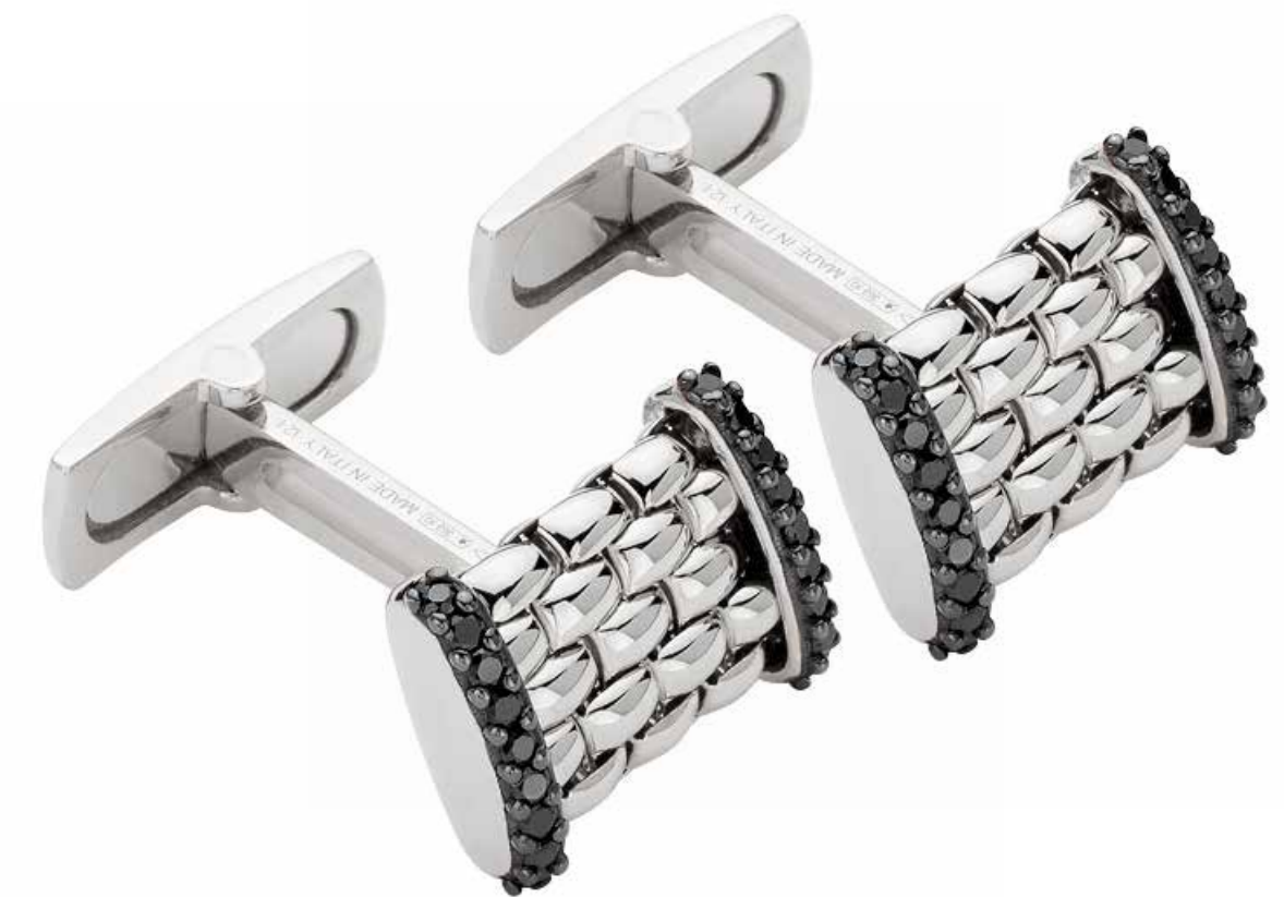
G11 BBRN | CT. 0,43 18 carat gold cufflinks with black diamonds.