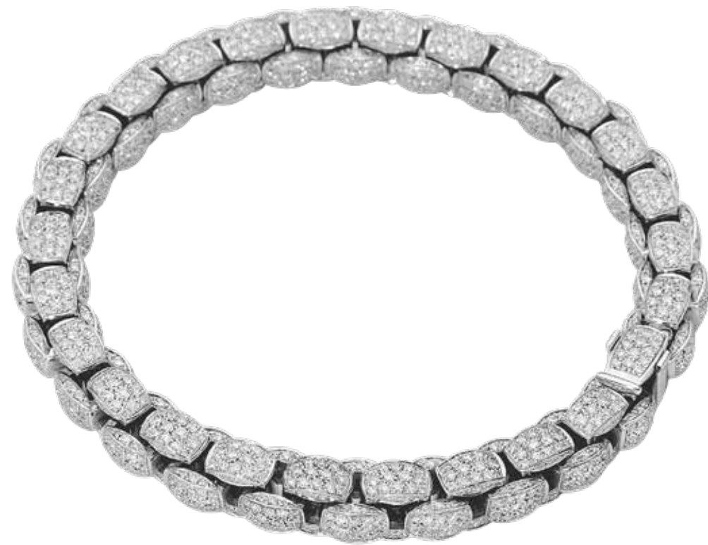
774B PAVE | CT. 10,14 Flexible bracelet with diamond pave' entirely made of 18 carat gold diamond pave'.