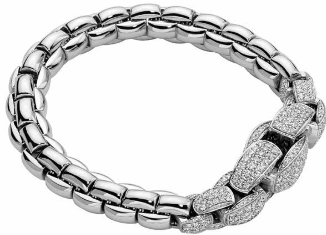
777B PAVE | CT. 3,77 Flexible bracelet entirely made of 18 carat gold with diamond pave'