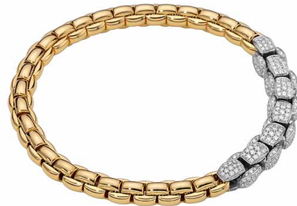
773B PAVE | CT. 2,51 Flexible bracelet with diamond pave' entirely made of 18 carat gold diamond pave'.