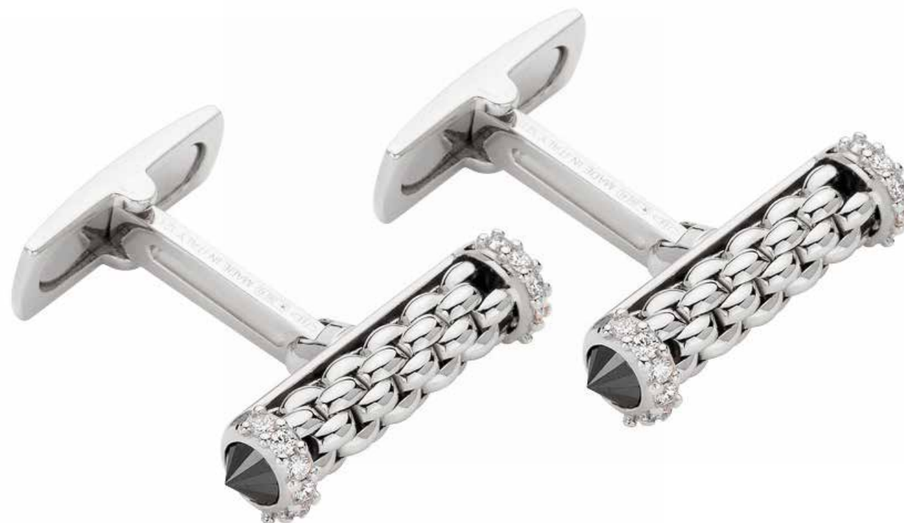
G06 BBR1 | CT. 1,64 18 carat gold cufflinks with white diamonds and black diamonds set upside down.