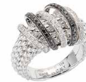
AN651 PAVE1 | CT. 0,73 18 carat gold ring with black diamond pavé.