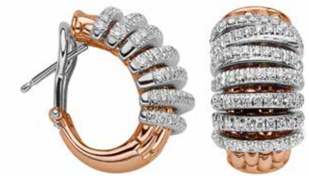
OR588 PAVE CT. 1,06 | Lenght 2 cm 18 carat gold earrings with diamond pave'.