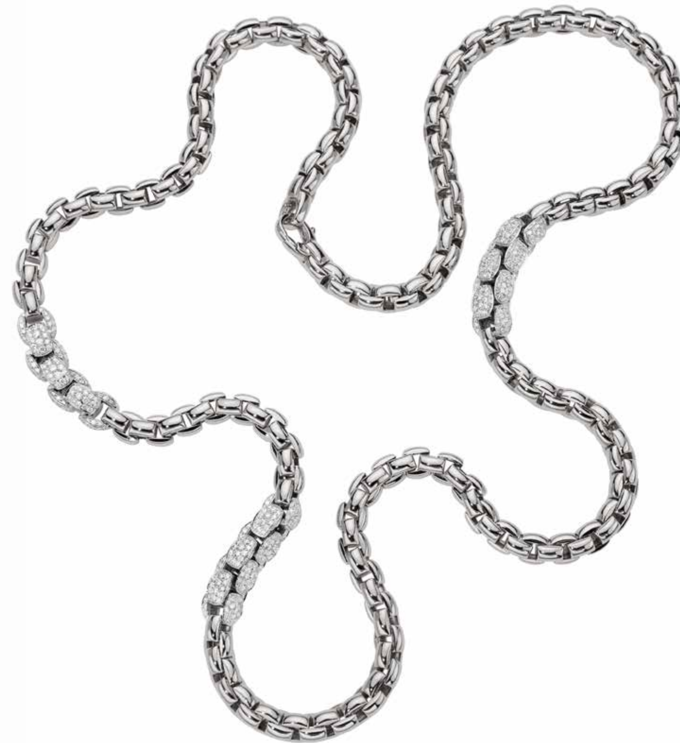
773C PAVE 70 | CT. 3,92 18 carat gold necklace with diamond paved (70 cm)