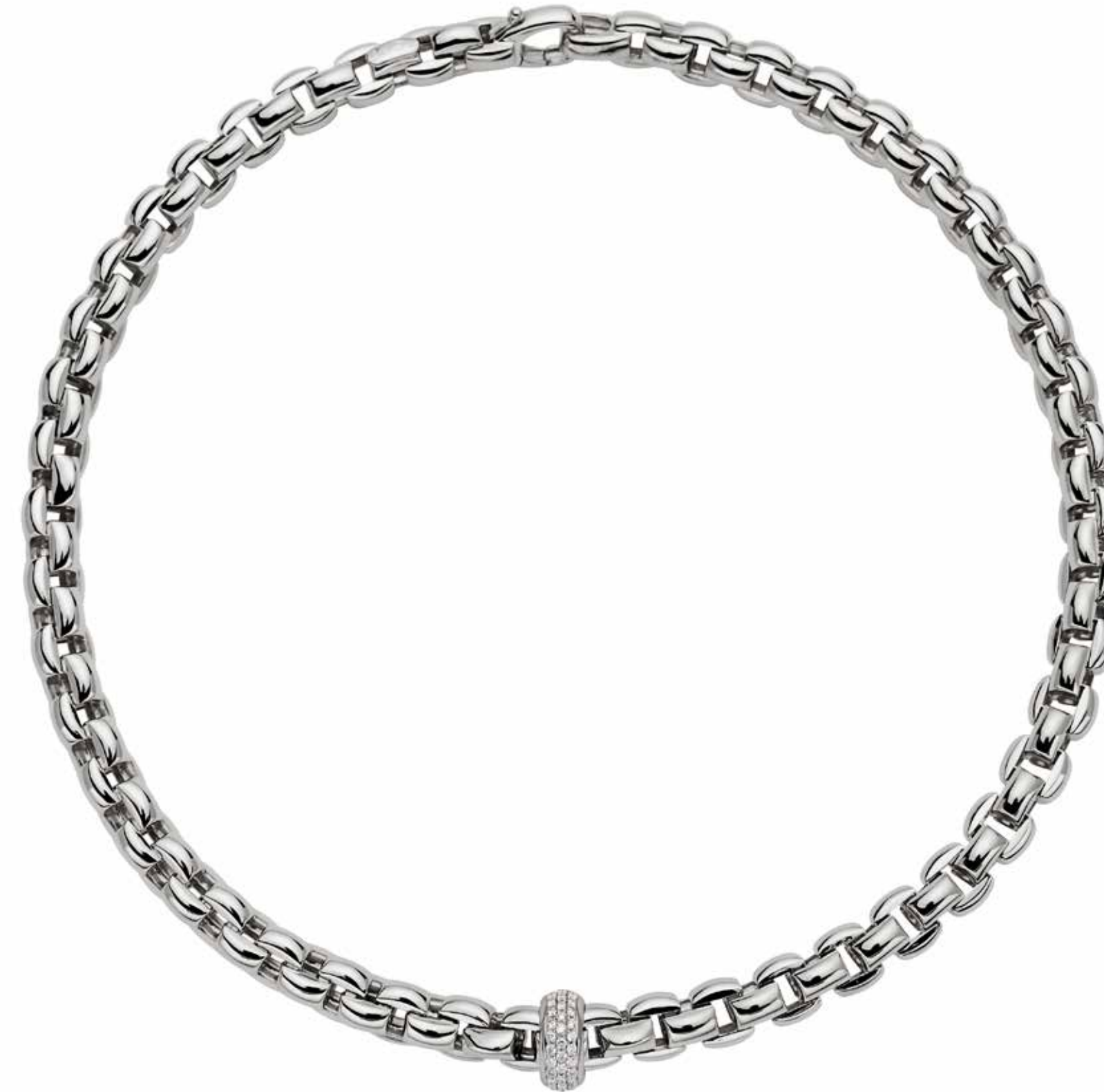
607C PAVE | CT. 0,58 18 carat gold necklace with diamond pavé rondel.