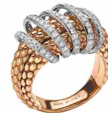
AN651 PAVE | CT. 0,7 18 carat gold ring with diamond pave'.