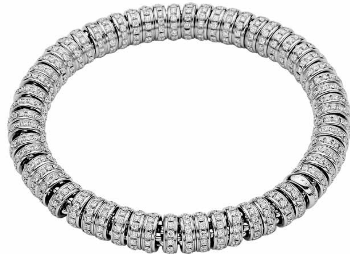
629B BBR | CT. 5,8 Flexible bracelet entirely made of 18 carat gold with gold and diamond rondels.