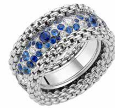
AN712 PAVE | CT. 3,01