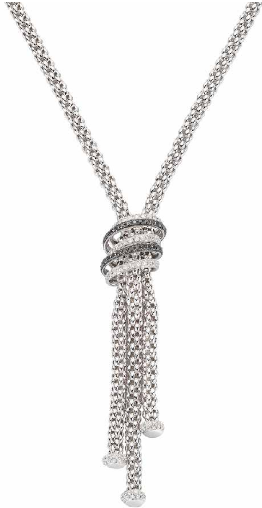
651C PAVE1 | CT. 1,69 18 carat gold lariat with black diamond pave'.