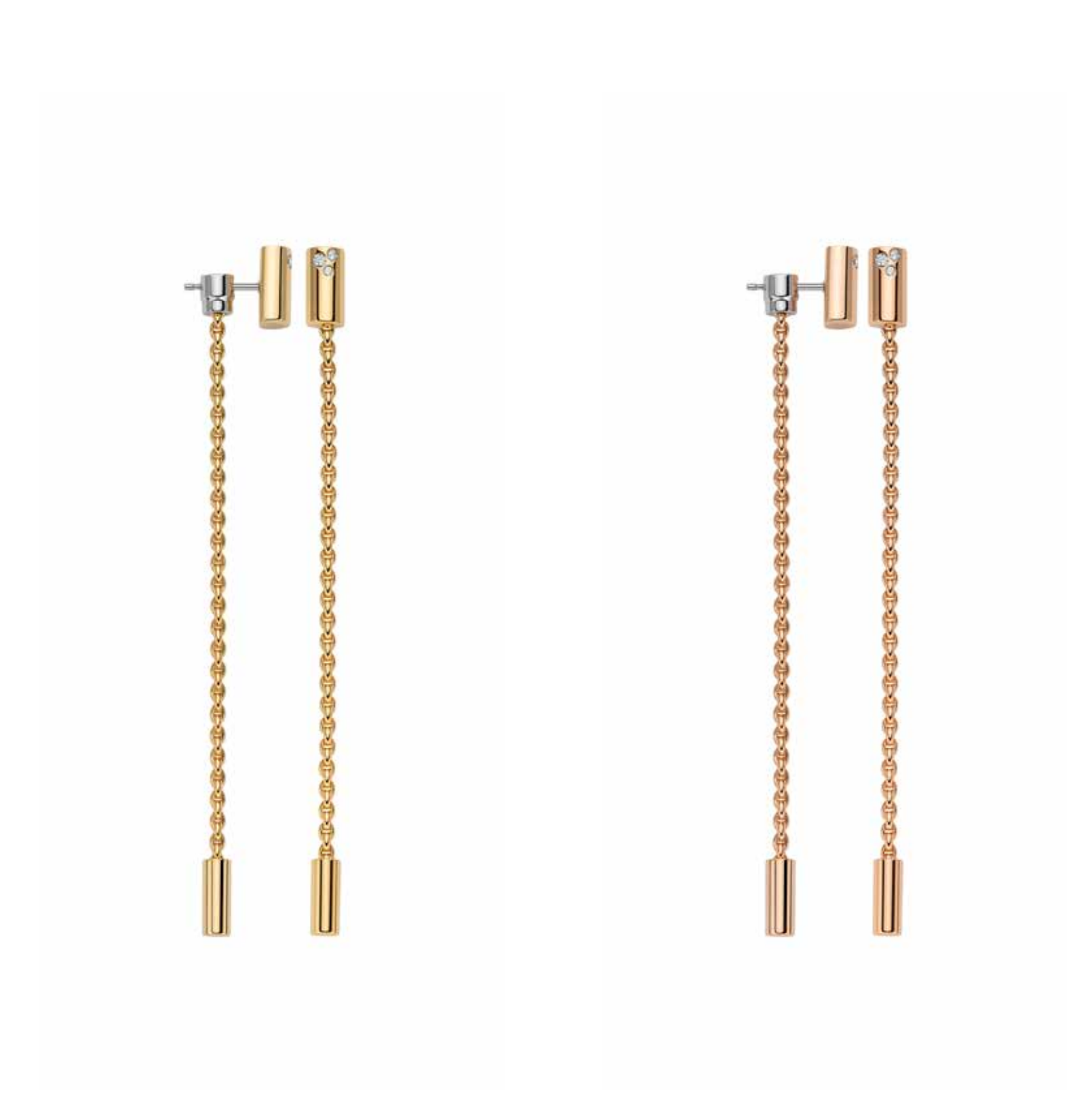
OR891 BBR | CT. 0,09 | Length 8 cm Pendant earrings made of 18 carat gold with diamonds.