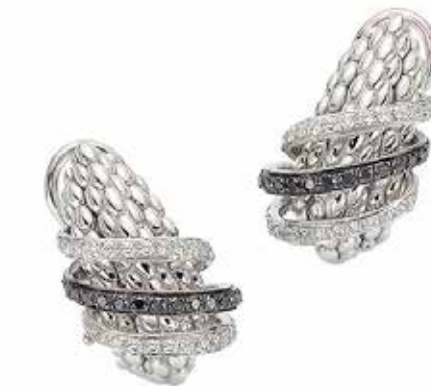
OR651 PAVE1 CT. 0,85 | Lenght 2 cm 18 carat gold earrings with black diamond pavé.