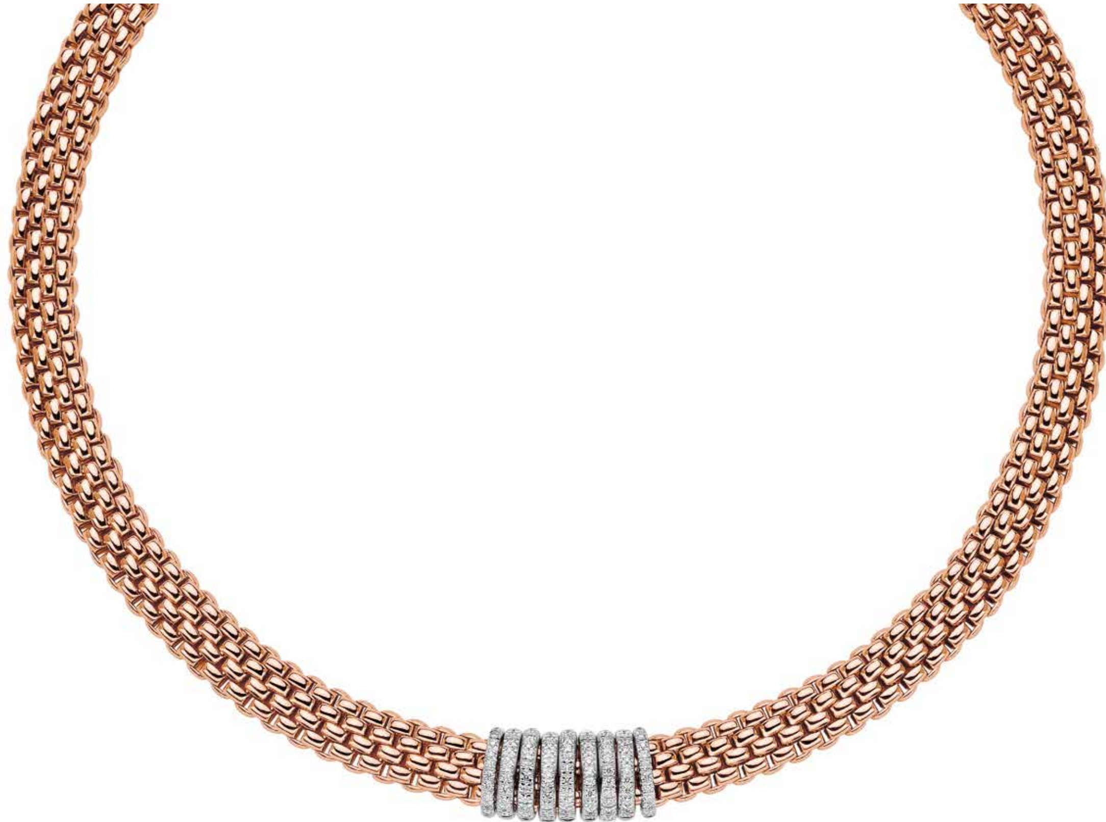
588C PAVE | CT. 0,68 18 carat gold necklace with diamond pave'.