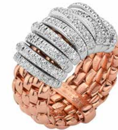
AN588 PAVE | CT. 0,68 Flexible ring entirely made of 18 carat gold with white gold and diamond pave' rondels.