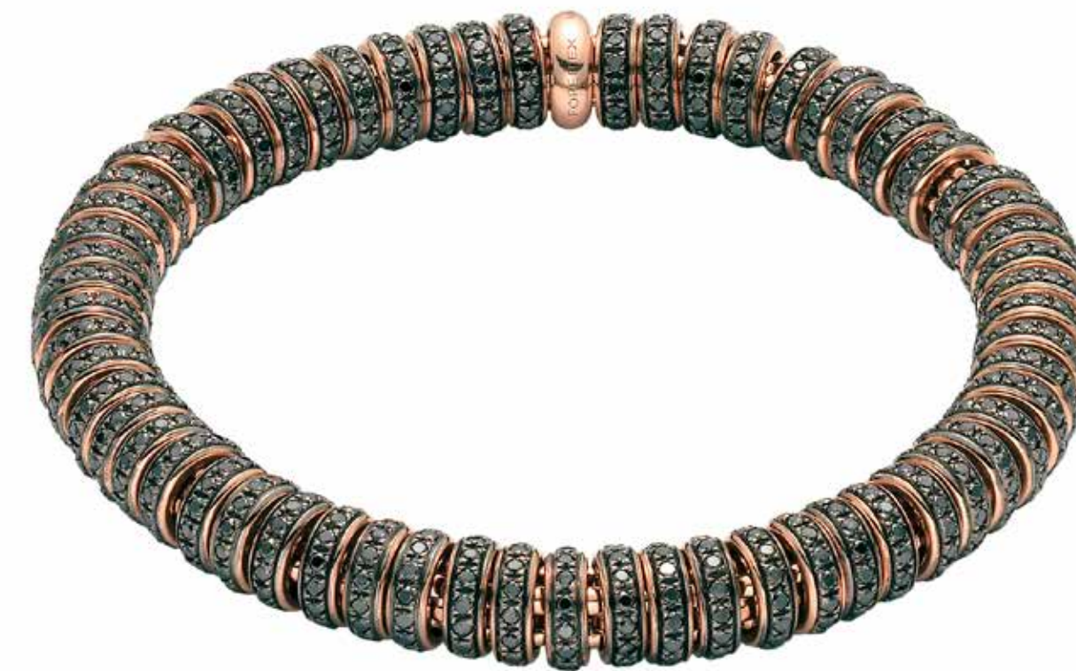
629B BBR1 | CT. 6,35 Flexible bracelet entirely made of 18 carat gold with black diamond pavé.