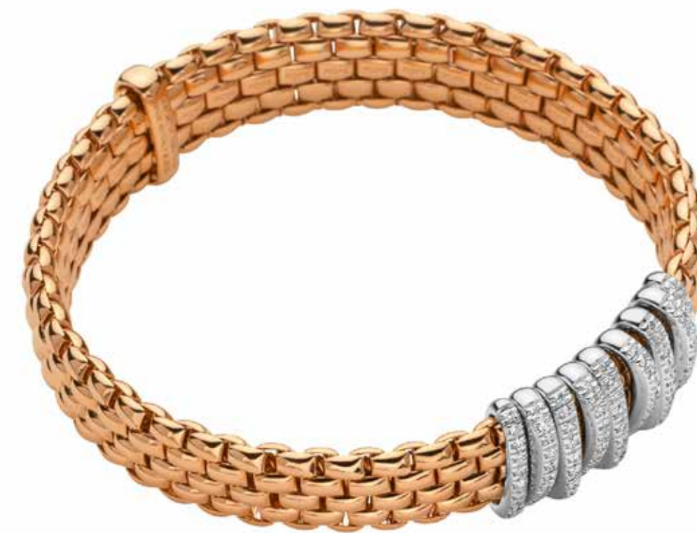
588B PAVE | CT. 0,68 Flexible bracelet entirely made of 18 carat gold with gold rondels and diamond pavé'.