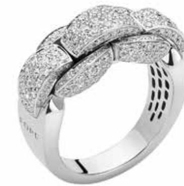
AN773 PAVE | CT. 1,15 18 carat gold ring with diamond pavé.