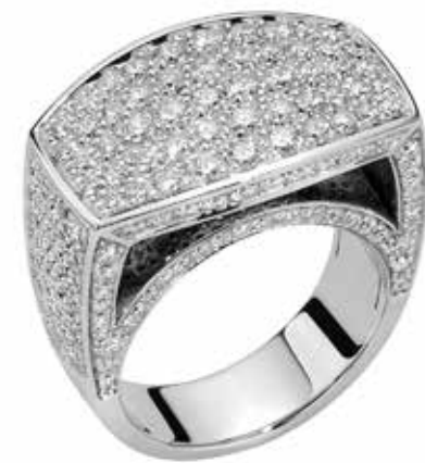
AN775 PAVE | CT. 2,94 18 carat gold ring with diamond pavé.