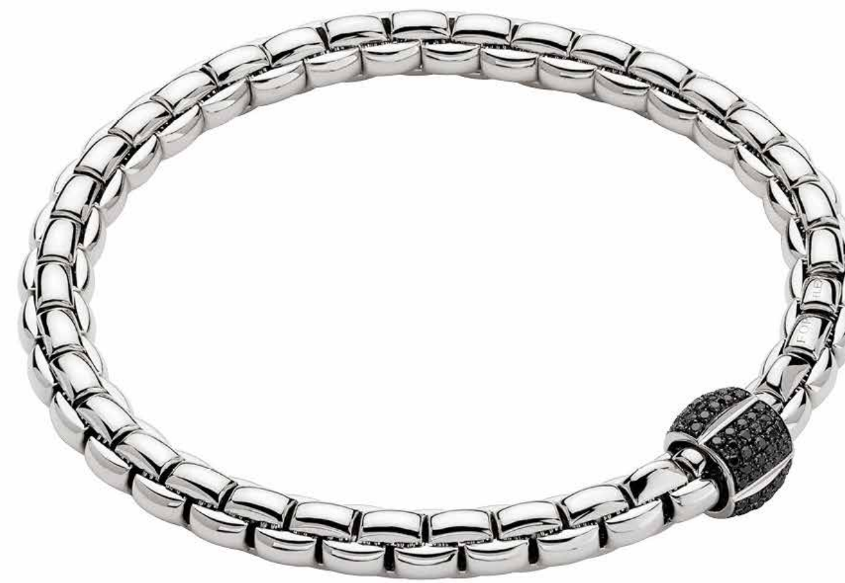
701B PAVEN | CT. 0,49

Flexible bracelet entirely made of 18 carat gold with gold rondel and black diamond pavé.