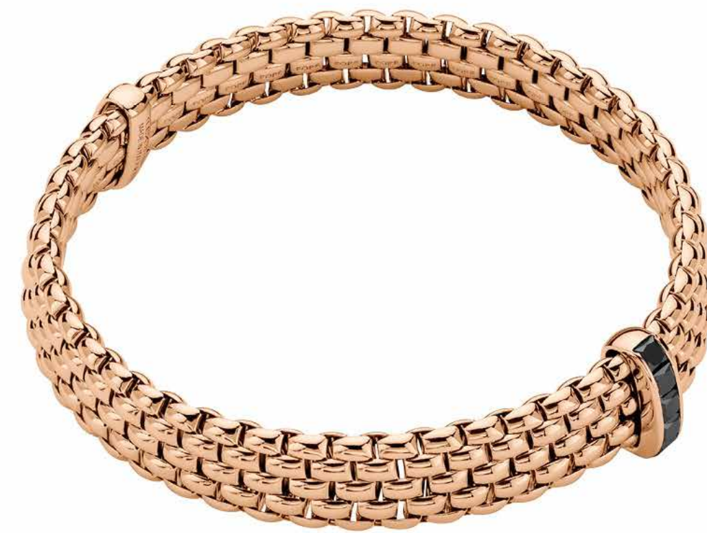
525B BBRN | CT. 0,7 Flexible bracelet entirely made of 18 carat gold with princess-cut black diamond feature.