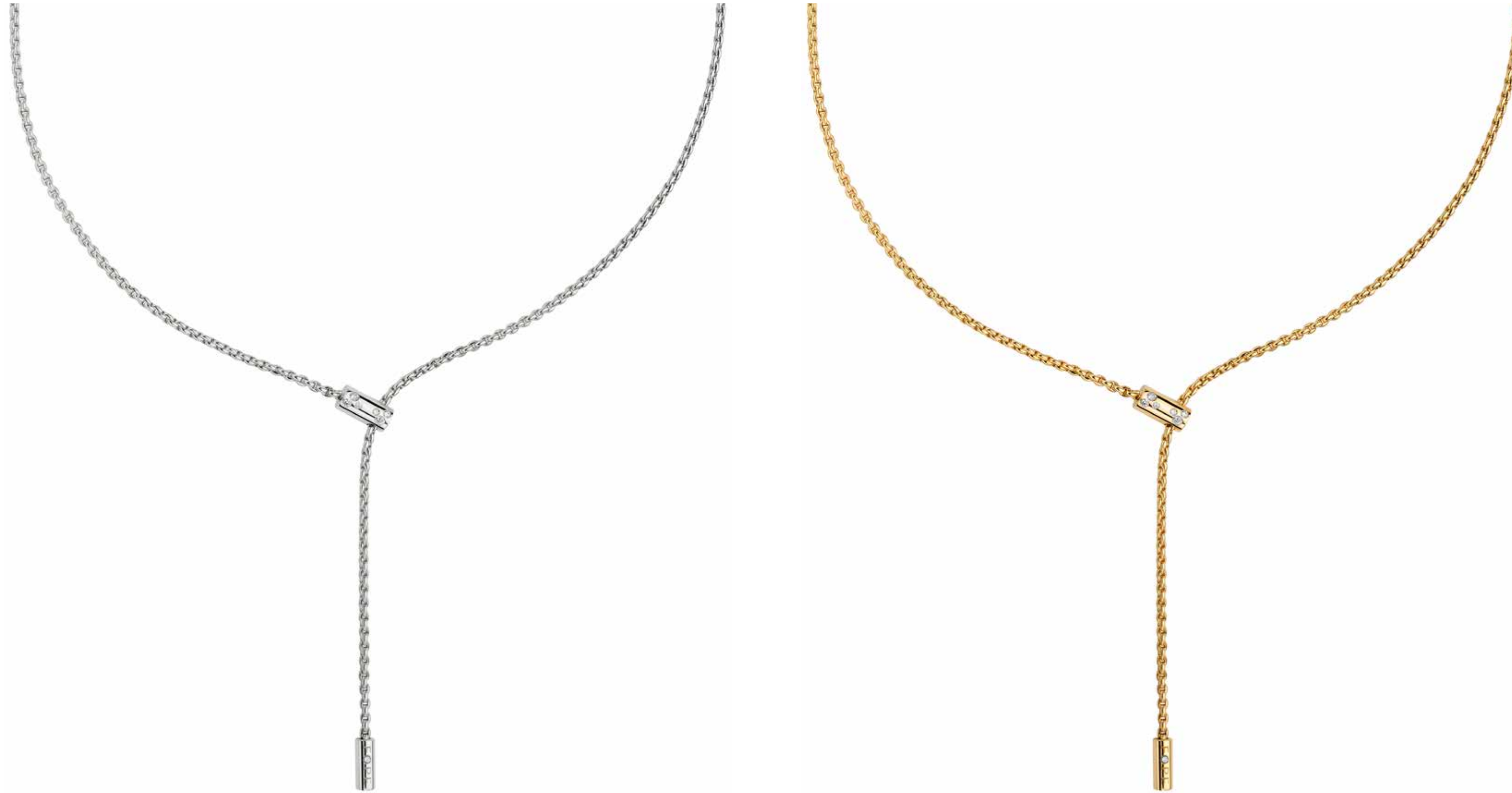
890FR BBR | CT. 0,11 18 carat gold lariat with sliding diamond clasp for adjustable length.