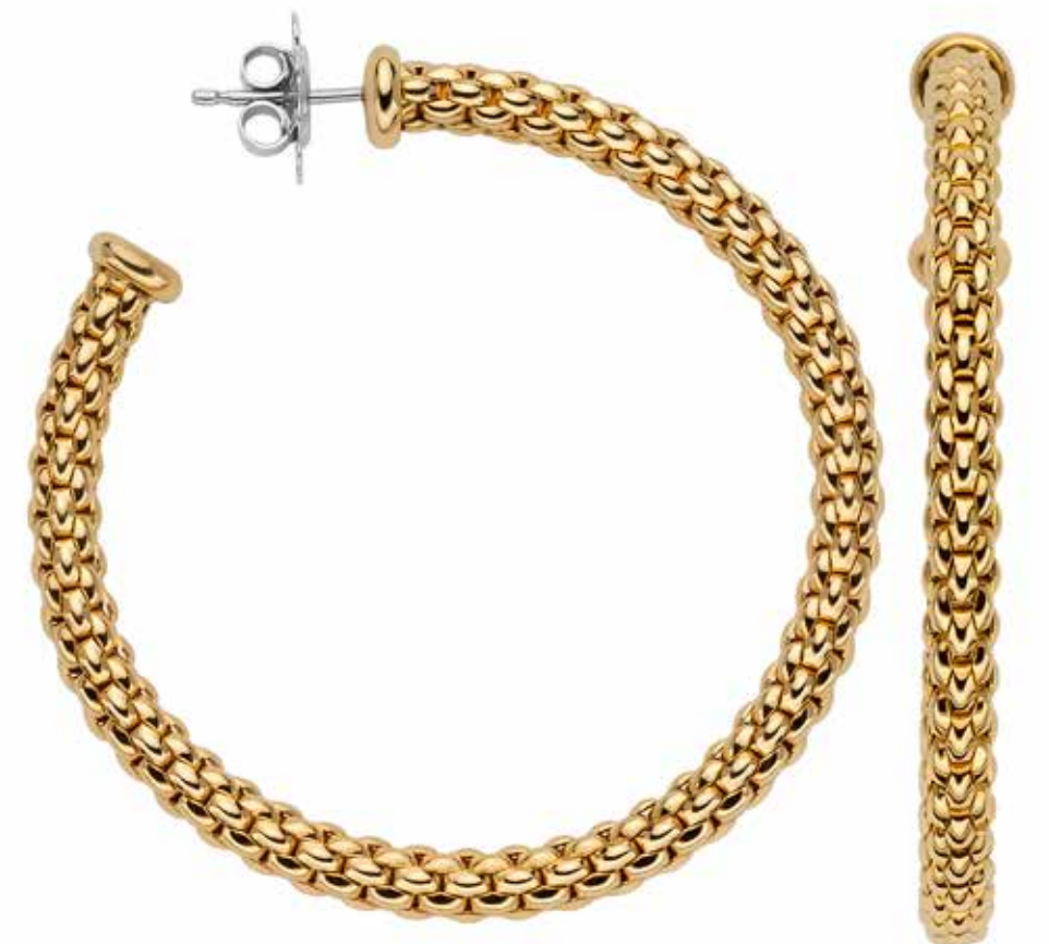
OR02 | Ø 4 cm Medium hoop earrings made of 18 carat gold. Cm: