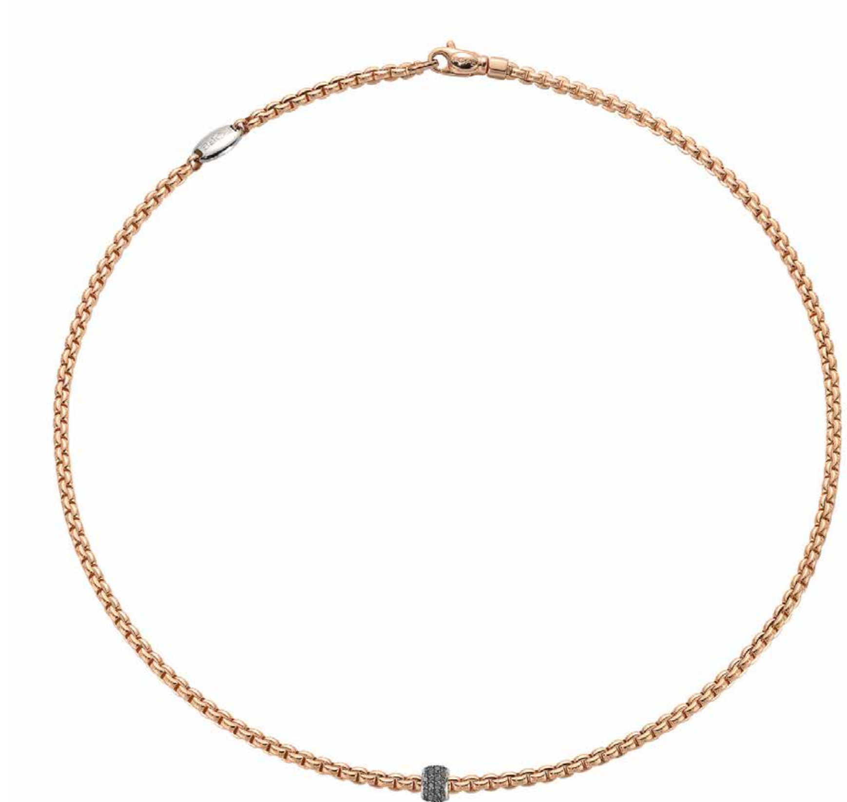
730C PAVEN | CT. 0,2 18 carat gold necklace with gold with black diamonds.