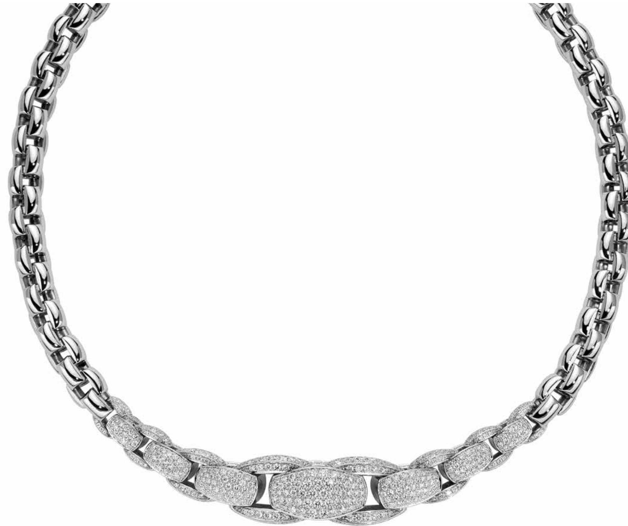
777C PAVE | CT. 10,39 18 carat gold necklace with diamond pavé.