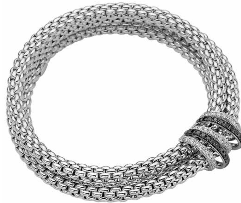
651B PAVE1 | CT. 1,26 Flexible bracelet entirely made of 18 carat gold with gold rondel and black diamond pavé.