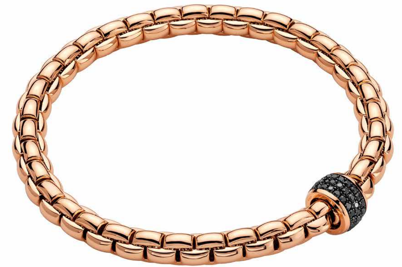
704B PAVEN | CT. 0,54

Flexible bracelet entirely made of 18 carat gold with gold rondel and black diamond pavé.