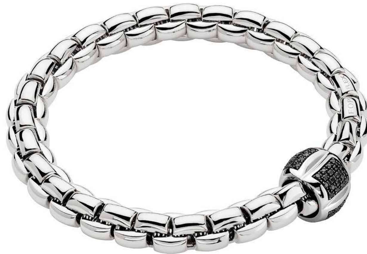
602B PAVEN | CT. 0,55

Flexible bracelet entirely made of 18 carat gold with gold rondel and black diamond pavé.