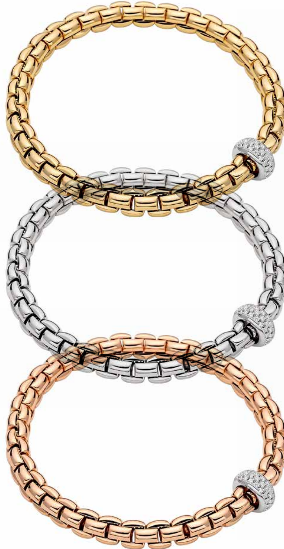
707B PAVE | CT. 0,4 Flexible bracelet entirely made of 18 carat gold with diamond pavé rondel.